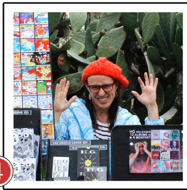
HG at D St. Offices