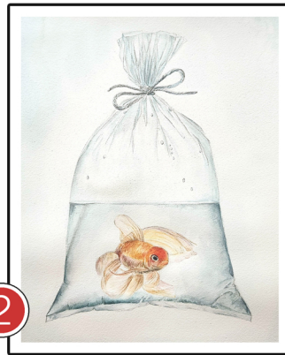
Yi-Chuan Chen at The Paint Chip