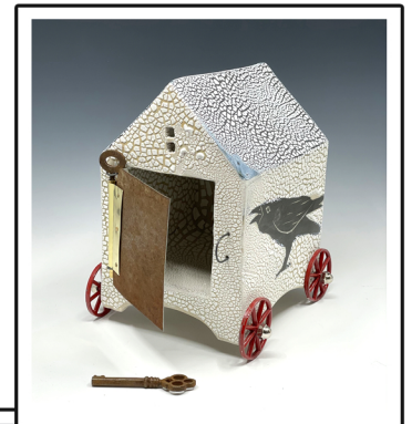
Thelma Weatherford at Arboretum Art Works