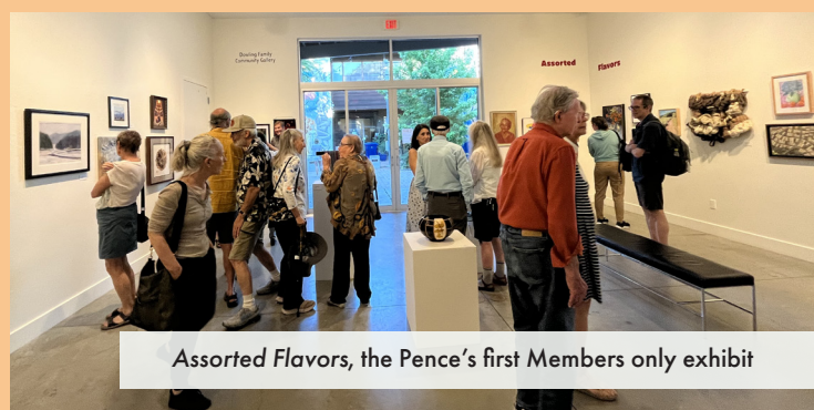
Assorted Flavors, the Pence's first Members only exhibit