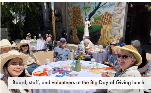
Board, staff, and volunteers at the Big Day of Giving lunch