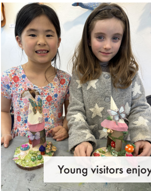
Young visitors enjoy Art in Action classes

■ Personnel & Taxes ■ Commissions & Stipends ■ Supplies/Food ■ Operating