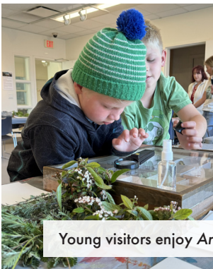
Young visitors enjoy Art in Action outreach classes

■ Personnel & Taxes ■ Commissions & Stipends ■ Supplies/Food ■ Operating