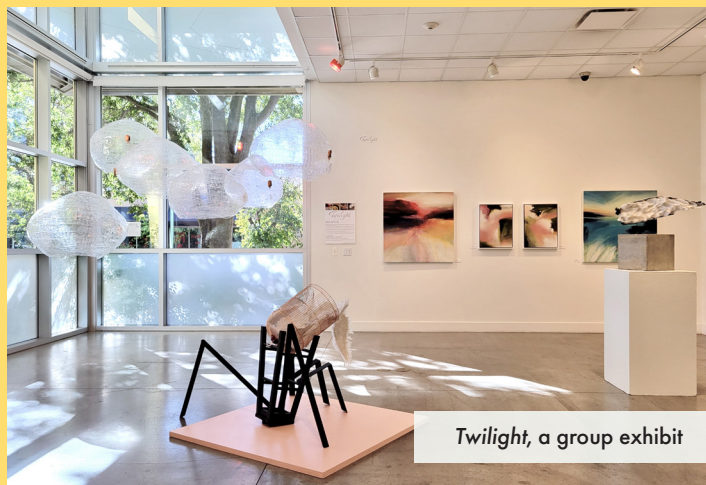
Twilight , a group exhibit