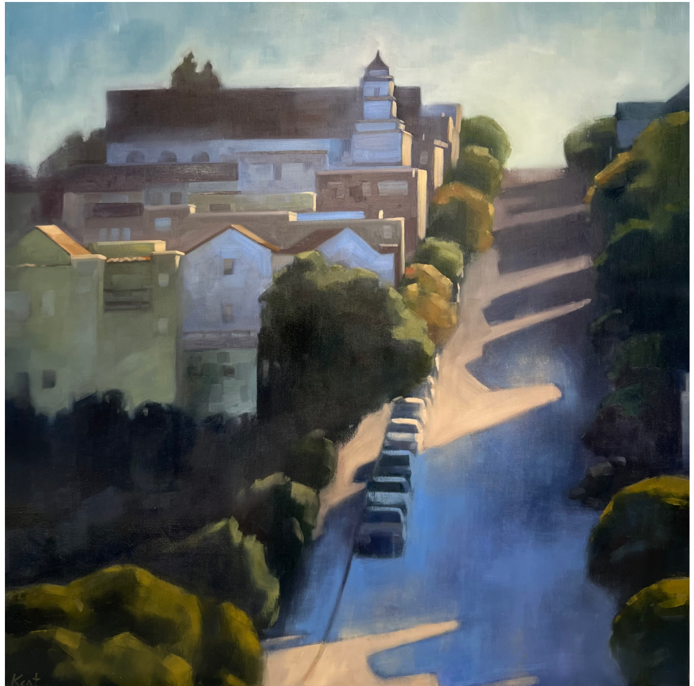
(Right) 19th and De De Haro Oil on canvas 48in x 48in $4000