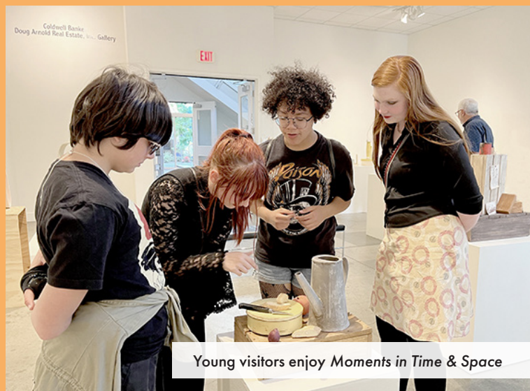
Young visitors enjoy Moments in Time & Space