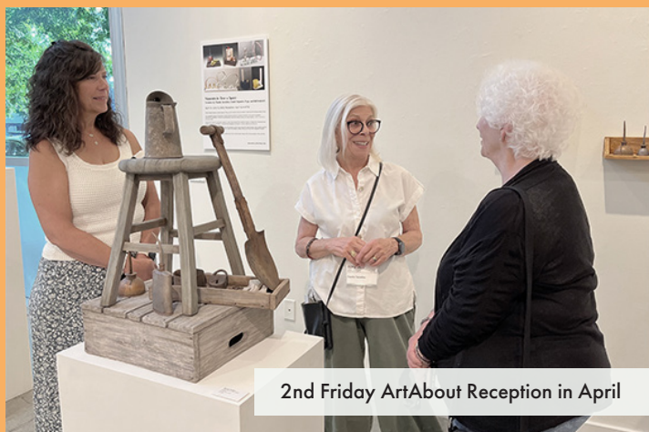
2nd Friday ArtAbout Reception in April