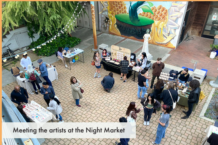
Meeting the artists at the Night Market